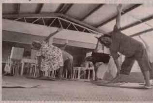
Pictured below - HACC Clients introduced to Tai Chi at Ngoonbi Farm Centre Based Day Care.

provides professional health and fitness instruction for the clients on Tuesdays. The functional strength based program is designed to help with falls prevention and to prevent physical and mental decline in the health of Older Adults. Since February 2006 the clients have been introduced to activities such as Aqua Fitness, Chairaerobics, light strength training under